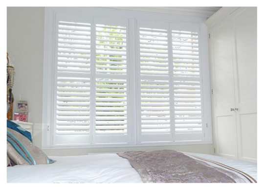
Shutter options for Units 14 & 15 bedrooms facing Library Parade